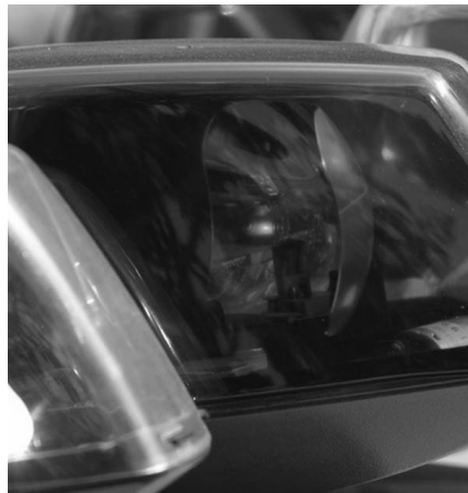
Three taken to hospital after I-88 crash