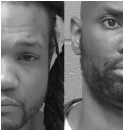
Joliet man breaks jaw of 'jailhouse lawyer' charged with murder: cops