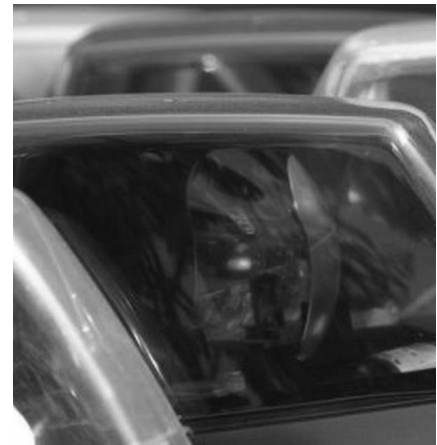
Police blotter: May 8, 2022